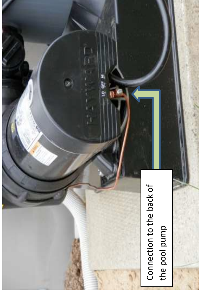
Connection to the back of the pool pump