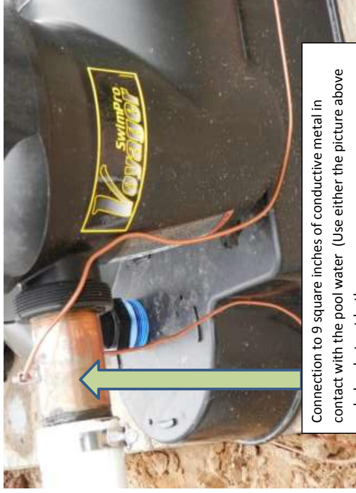
Connection to 9 square inches of conductive metal in contact with the pool water (Use either the picture above or below but not both).